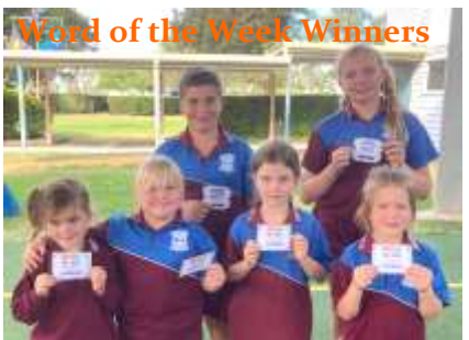
Word of the Week Winners