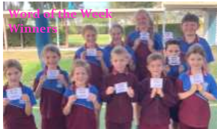
Word of the Week Winners